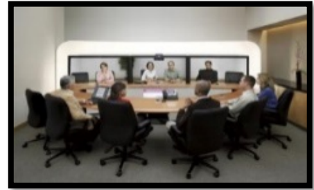
Panel of Specialists Meeting with Primary Care Team

The Accountable Care Collaborative (ACC) invites you to participate in a new Chronic Pain Disease Management Program (Program) . Modeled after the Project ECHO (Extension for Community Healthcare Outcomes) program developed in New Mexico, the Chronic Pain Management Program leverages cutting edge telehealth technologies to connect PCMPs to specialists. PCMPs consult directly with specialists regarding client cases and learn best practices for treating clients with a variety of chronic pain conditions.